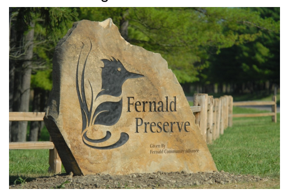
The FCA donated the engraved rock at the entrance to the Fernald Preserve.

When the Fernald cleanup was completed in 2006, the Living History Project evolved into the FCA—a nonprofit 501(c)(3) organization. Today the FCA works on historical, ecological, and educational projects that have helped the Fernald Preserve become the valuable community asset it is now. The FCA is working with the U.S. DOE Office of Legacy Management to tell the story of Fernald, develop a center of education at the site, and highlight the lessons learned from the sites various missions for current and future generations.